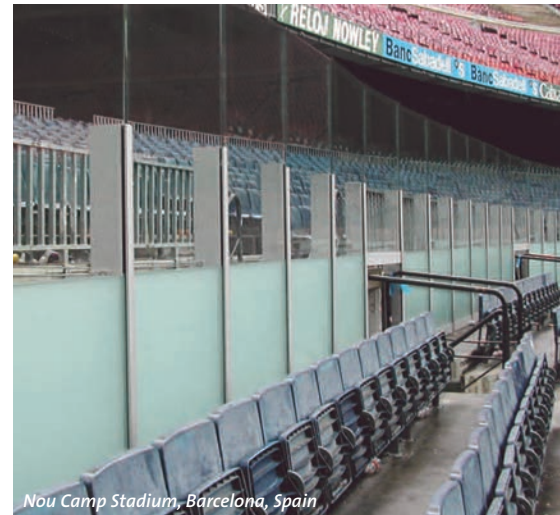
Nou Camp Stadium, Barcelona, Spain

Please refer to the documents entitled "SGG VISION-LITE Instructions for use" and "SGG VISION-LITE, Assembly, installation and maintenance".