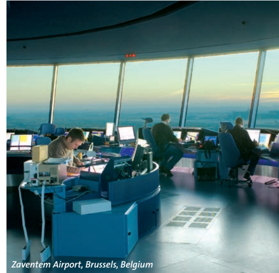
Zaventem Airport, Brussels, Belgium

The maximum dimensions of the finished product depend on the technical capabilities of the processing site.