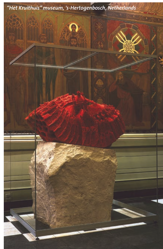
"Het Kruithuis" museum, 's-Hertogenbosch, Netherlands