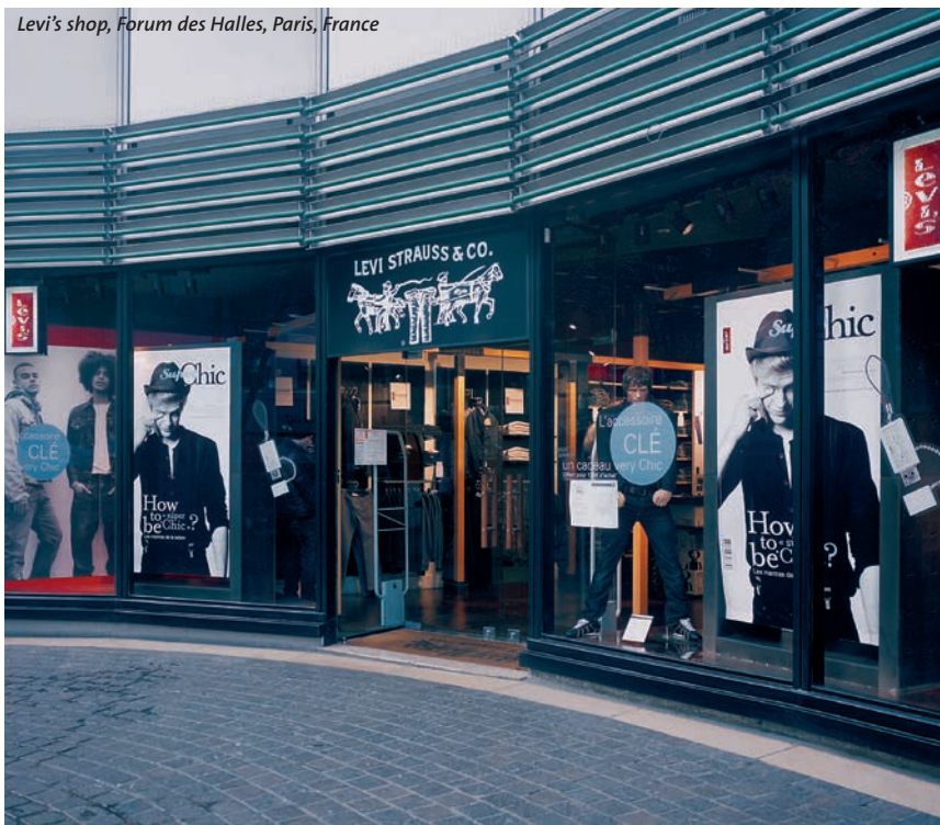
Levi's shop, Forum des Halles, Paris, France